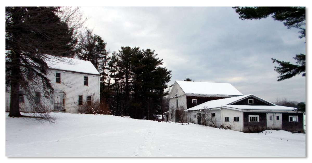
Tidewater Farm (2014)

Summary . The story of Tidewater Farm is the story of Falmouth. It is the story of immigrants extending back to the first English settlers of our town. It is a story involving some of our most prominent citizens over the centuries. The story illuminates the close ties between the people who lived on the farm and the broader community. Tidewater Farm connects us to our town's maritime and agricultural heritage.