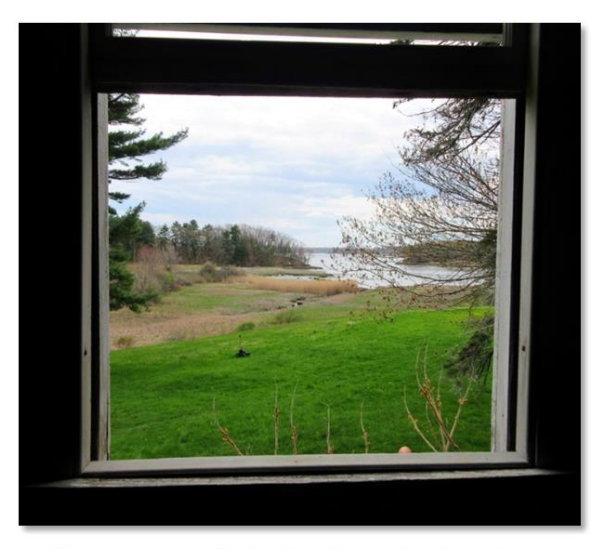
Looking towards Portland from the Farmhouse

The Moodys or Merrills would have been shocked by this view through a front window of the Tidewater farmhouse.