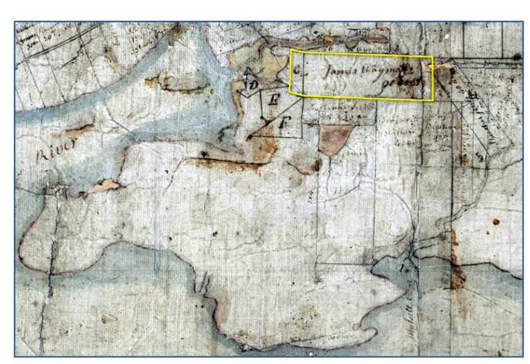
Falmouth Foreside with Wyman's tract in yellow (1732)8

Wyman family history observes that many Falmouth residents moved to Gloucester, Mass., about 1690 due to the looming threat of war. The situation in Falmouth became more settled with signing of the Treaty of